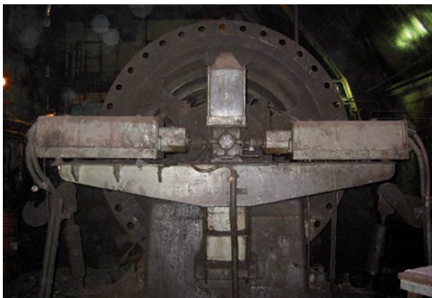
Before: Old skip-car control mechanism with two mechanical geared cam limit switches.