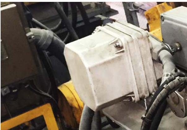
Before: Mechanical cam limit switch.